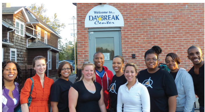
First DDP community service project at Daybreak Center in September, 2012, coordinated by DDP Peer Mentors from Joliet Junior College.

DDP is celebrating its five-year anniversary, and it continues to fulfill the initial mission. Since DDP's first cohort transferred to GSU in 2012, over 360 DDP students have transferred to GSU or other universities after completing their associate's degrees. Over 103 of those DDP transfer students have graduated with their bachelor degrees, many of which are already pursuing graduate degrees. The DDP model has been recognized and awarded by national higher education organizations including The American Association of State Colleges and Universities and The National Resource Center for the First Year Experience and Students in Transition.