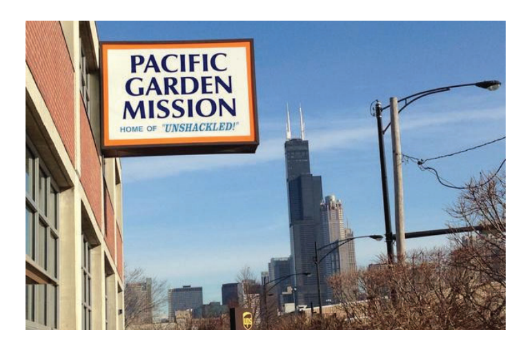
Pacific Mission Gardens was founded in 1877.

The Center for Civic Engagement and Community Service continues to create service learning and volunteer opportunities for the GSU community. This year the Center is sponsoring service opportunities that correspond to the cohorts themes to assist students and faculty. The Center has sponsored three service opportunities for students to volunteer in an around the Chicago and the Southland area.