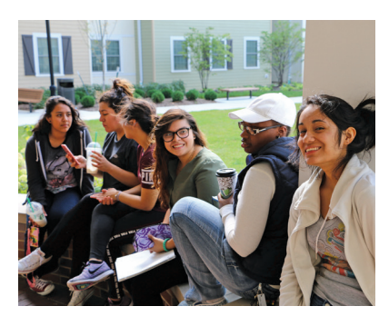
Students relaxing at Prairie Place.

Current students living in prairie place will be able to re-contract for 2016/2017 housing when they return to the campus in January. New applications will begin to be accepted FEBRUARY 8, 2016