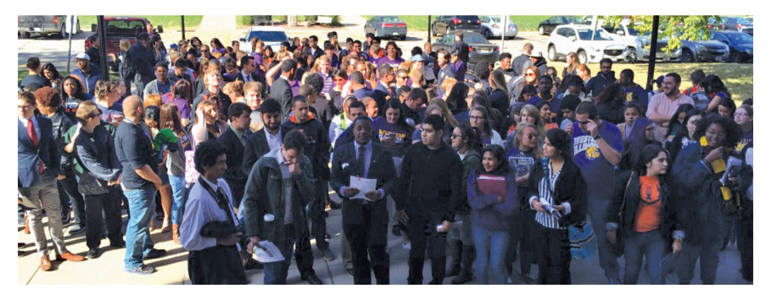
Hundreds of other students from 9 state universities gathered in Springfield to lobby their respective legislators to support their request not to cut Illinois MAP Grants from the budget.

In response to the Governor's threat to eliminate higher education from the budget, 22 student representatives from Student Senate, Media Society, Black Student Union, TWAG, Community Service Council, Lambda Pi Eta, the Phoenix, Student Life, and the Freshmen Leadership Seminar traveled by bus to the Illinois State Capital to have their voices heard.